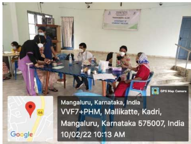
Health check up at St. Ann's Home for the Aged

A health camp was conducted for the inmates of St. Ann's Home for the Aged in Mangalore. A total of 40 inmates utilized the facility. General examination was done and their vitals were assessed. Medications were prescribed wherever necessary. All patients were screened for DM and HTN. Psychiatric and dermatological evaluation were also done for all the inmates. The staff present there were thanked for their cooperation.