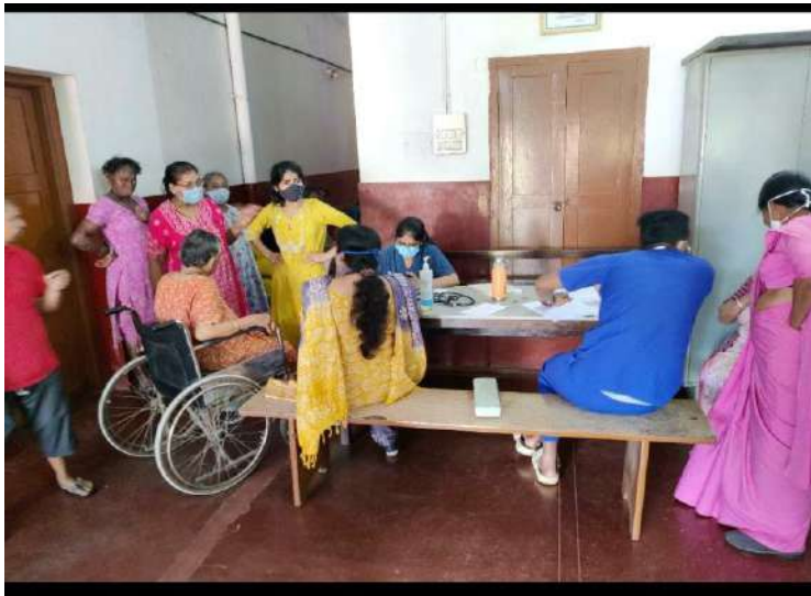
Specialty outreach camp at ST. Mary's old age home, Jeppu

A specialty outreach camp was conducted at St. Mary's old age home, Jeppu on 21-02-2022 by the Department of Community Medicine, Yenepoya Medical College, Post graduates from department of OBG and Community medicine and intern from Yenepoya medical college attended the camp. A total of 67 residents attended the session.