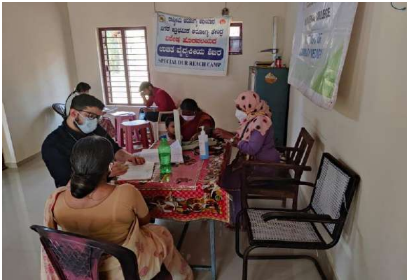
Health Camp conducted at Railway station Anganwadi Mangalore

A specialty outreach camp was conducted by the Department of Community Medicine, Yenepoya Medical College, at Railway station Anganwadi Mangalore for the railway station staffs and their family members on 18/2/2022. Total 30 patients attended the camp. BP monitoring, and GRBS checking was done for all patients attended. Free medicines were provided to the patients.