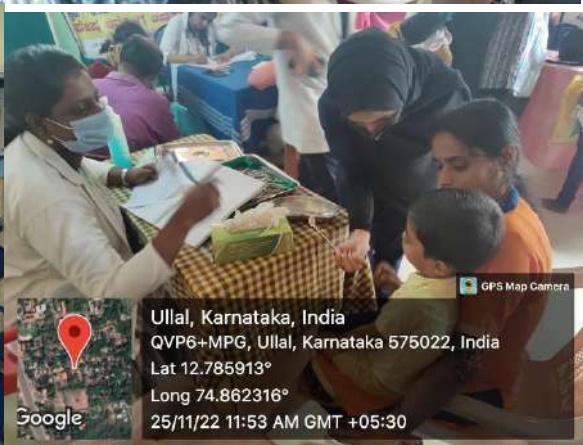
Ullal, Karnataka, India QVP6+MPG, Ullal, Karnataka 575022, India Lat 12.785913° Long 74.862316° 25/11/22 11:53 AM GMT +05:30