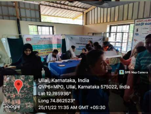
Ullal, Karnataka, India QVP6+MPG, Ullal, Karnataka 575022, India Lat 12.785936° Long 74.862523° 25/11/22 11:35 AM GMT +05:30