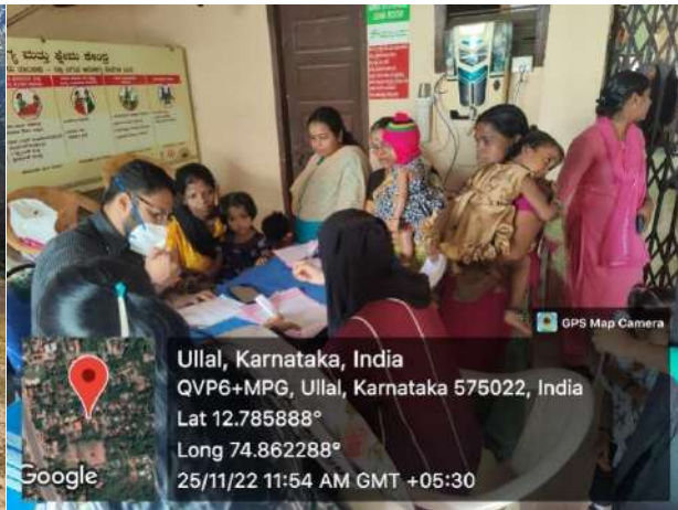
Ullal, Karnataka, India QVP6+MPG, Ullal, Karnataka 575022, India Lat 12.785888° Long 74.862288° 25/11/22 11:54 AM GMT +05:30