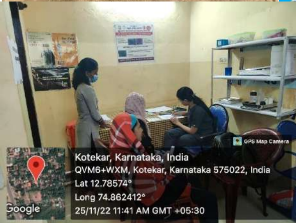
Kotekar, Karnataka, India QVM6+WXM, Kotekar, Karnataka 575022, India Lat 12.78574° Long 74.862412° 25/11/22 11:41 AM GMT +05:30