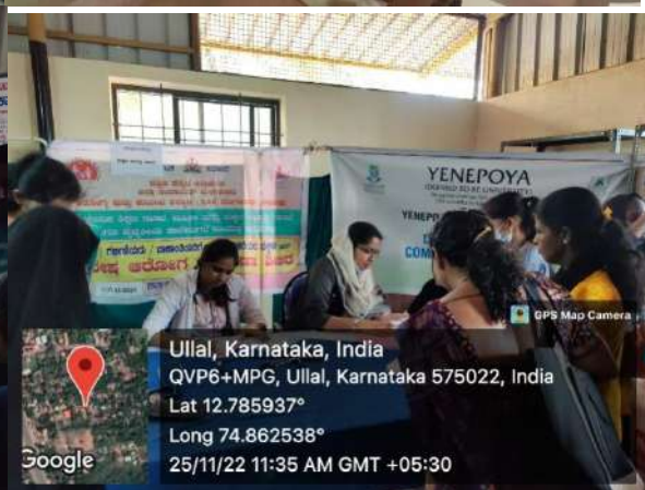
Ullal, Karnataka, India QVP6+MPG, Ullal, Karnataka 575022, India Lat 12.785937° Long 74.862538° 25/11/22 11:35 AM GMT +05:30