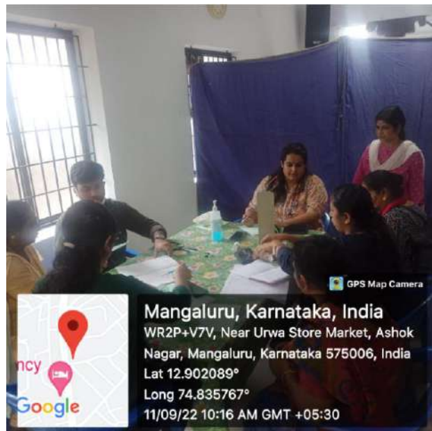
ManhilaMandali, Urwa store, Mangalore