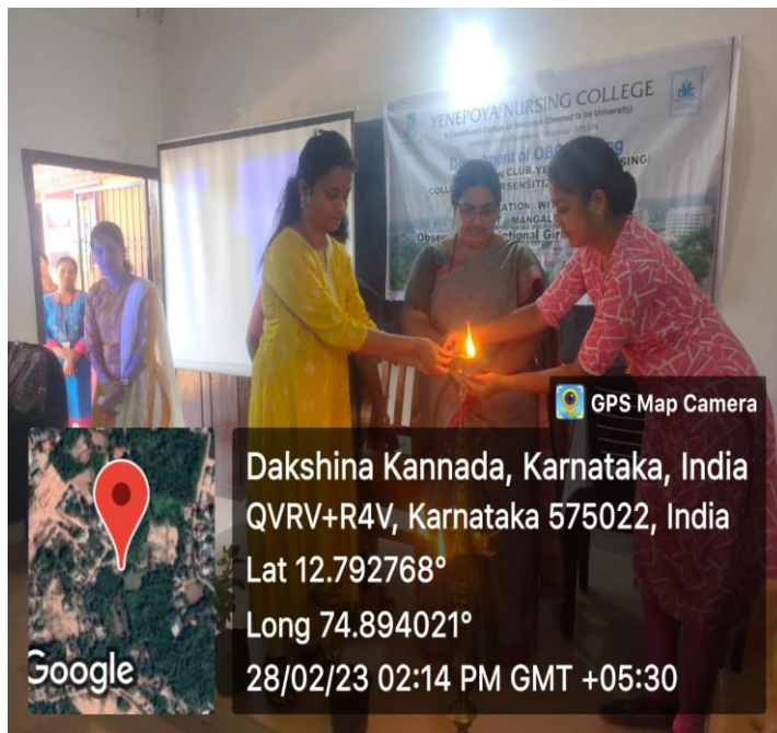
Figure1: Inauguration of the programme