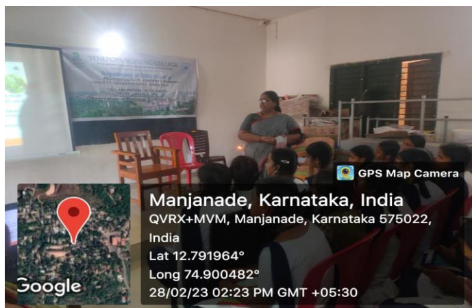
Figure 3: Awareness talk