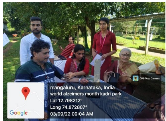
Figure 2: Health assessment