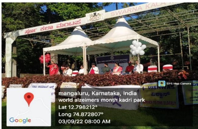
Figure 1: Launch of Alzheimer's month-Kadri park