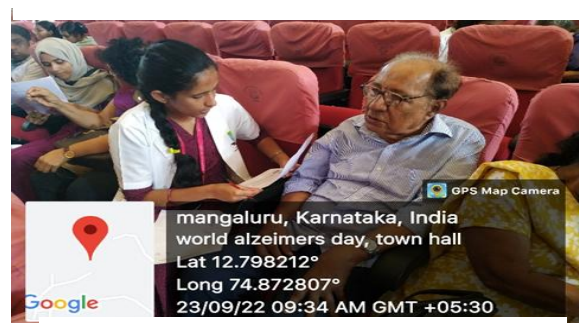
Figure 4: MoCA assessment by BSc nursing