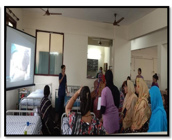
Figure 2 awareness talk on breast feeding