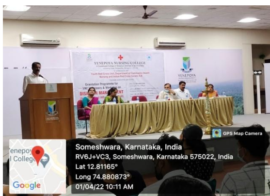
Figure 1. Inauguration of the program