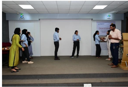
Session on Substance Abuse