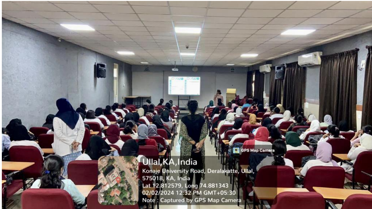
Fig 2: Participants from I BDS, II BDS and faculty members