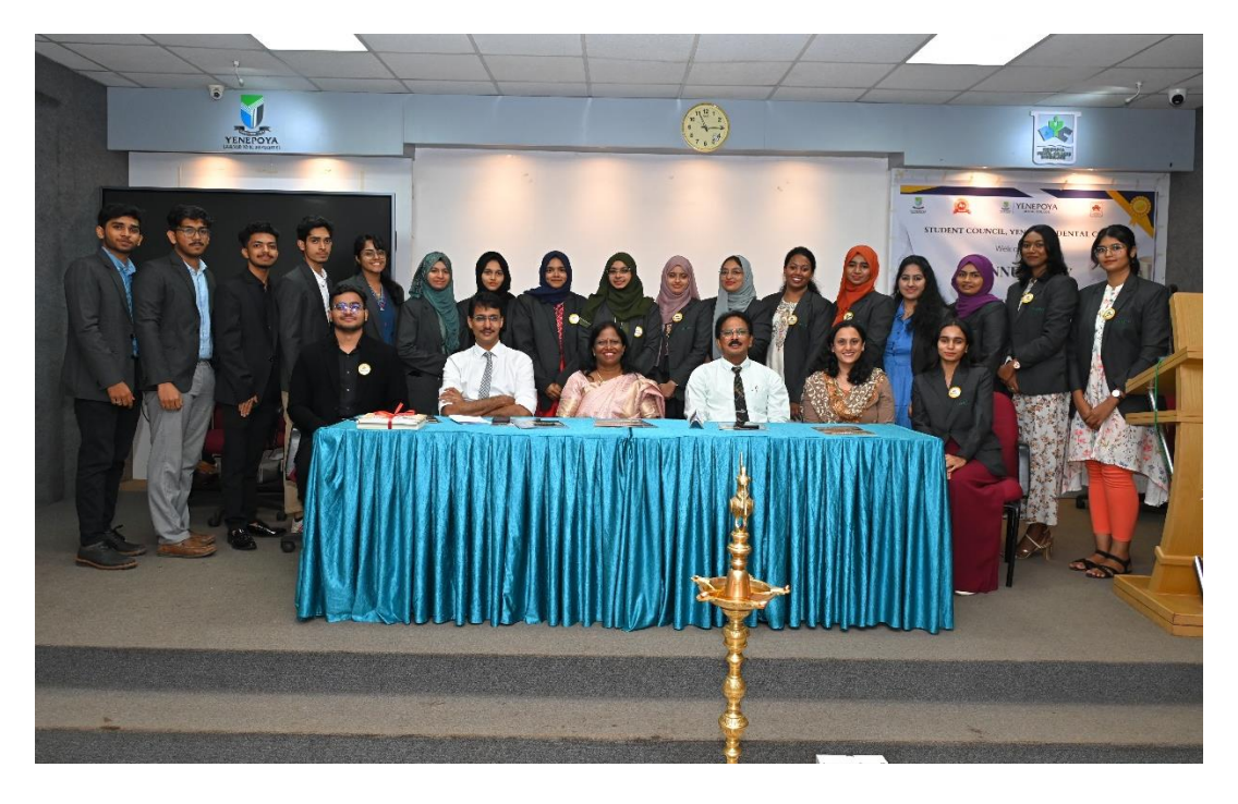
Fig 4: Members of the Student Council of 2024-25 with the dignitaries