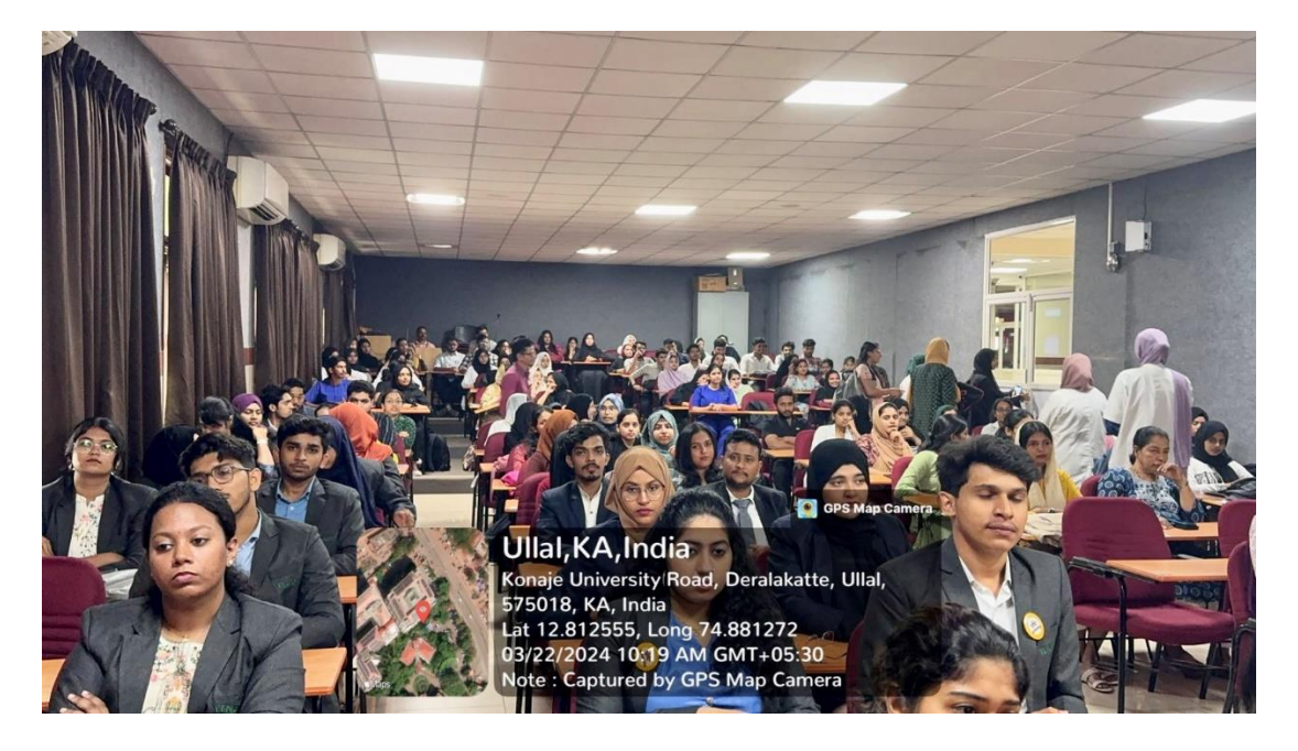
Fig 2: Students from II BDS, student council members and faculty members